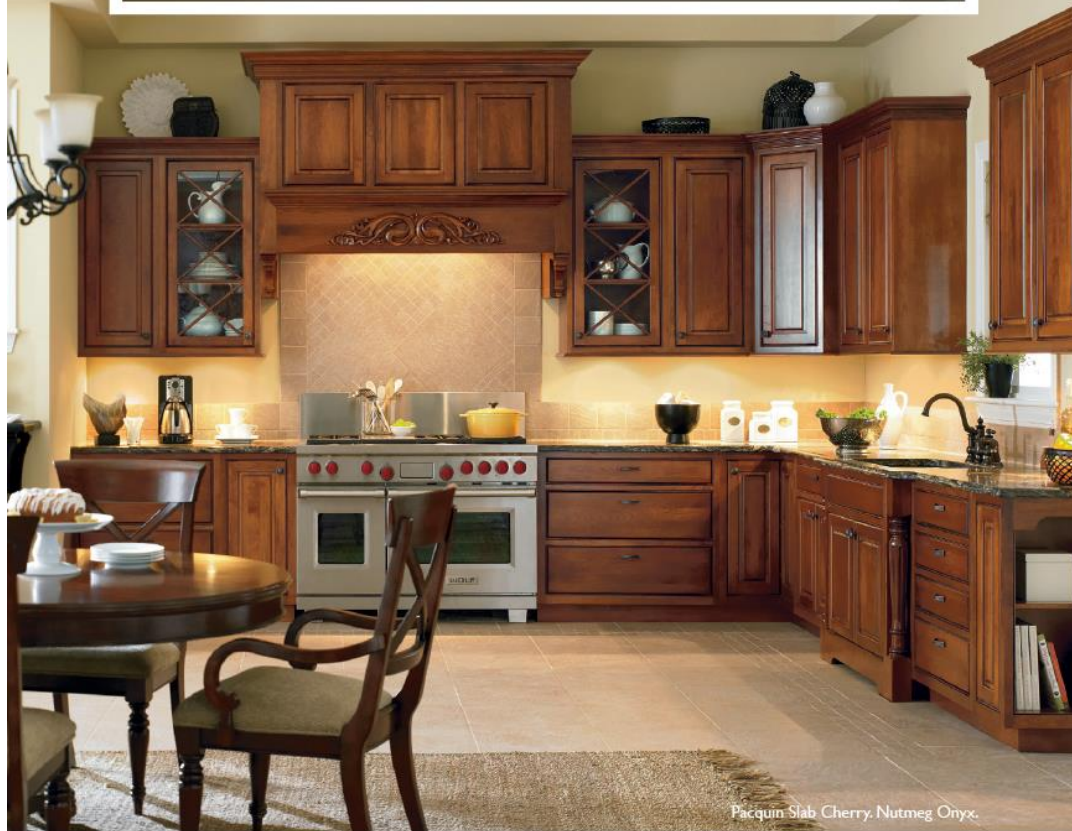
Pacquin Slab Cherry, Nutmeg Onyx.

Bring dreams to reality and visions to life with Omega. Transform your home from everyday to dramatic with endless opportunities and lasting beauty.